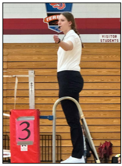
New officials training at Fond du Lac High School the week between Christmas and New Year's was a huge success.

July 29-30: Badger Region Beach Championships at Bradford Beach in Milwaukee