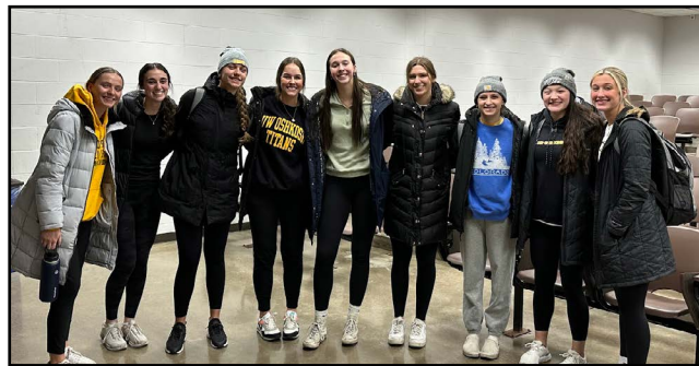
Members of the University of Wisconsin-Oshkosh women's volleyball team underwent officials training last week.

NOTE: When you are given an assignment don't forget to click on the notes link (if applicable) to see any special details or information about the tournament before you accept. Assigners use the notes to enter important information regarding the tournament.