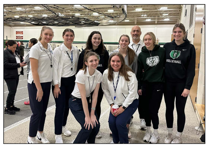
New officials were trained last week at the University of Wisconsin-Parkside.