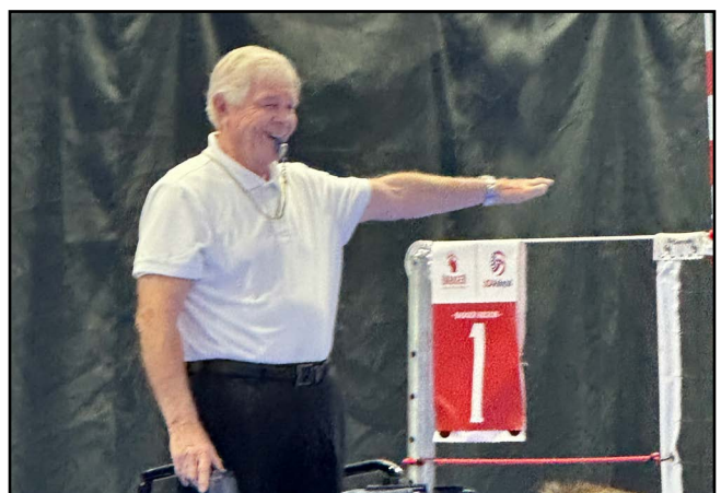
The Badger Region has been training new officials as part of the Badger Region Youth Fall Volleyball League in New Berlin. If you know an individual who wants to be a ref, there are still opportunities to train there this fall.