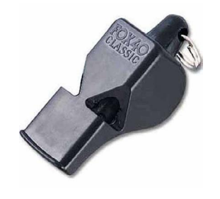
Region Championships this week.

That being said, we are beginning to open the opportunity to officiate at the Badger