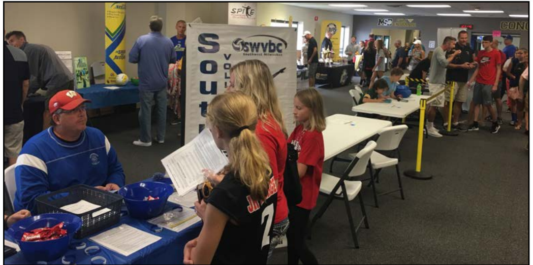
This year's Badger Region Club Volleyball Open House is Sept. 12 at the Milwaukee Sting Center.