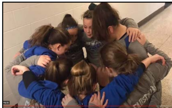
Club Video Link: For a link to the Southwest Milwaukee VBC video, click the image above.

At Southwest, kids can get a competitive club experience while still being active in high school activities like sports and music. We actually encourage multi-sport athletes and strive to make a schedule that is conducive to that.