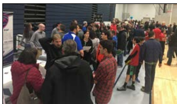
The boys open house at Pius High School draw hundreds of boys and their families each year.

On top of that, it's always great to see the camaraderie between coaches and club directors who join us at these gatherings. While they may be