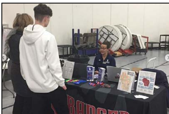
Visitors stop by the Badger Region table at boys club volleyball open house at Pius High School in early November of 2019.

Not all of the participants answered every question, but you get the idea. Now "turn the page" and enjoy our virtual open house.