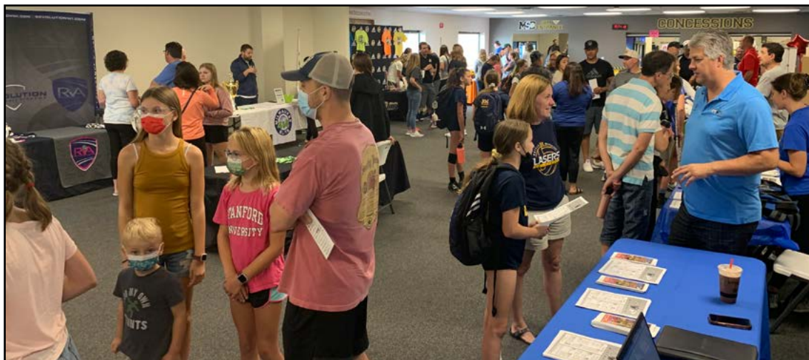
Parents and athletes talk to potential clubs at a girls club volleyball open house in September of 2021.

WWW.BADGERVOLLEYBALL.ORG ~ MEMBERSHIP@BADGERVOLLEYBALL.ORG