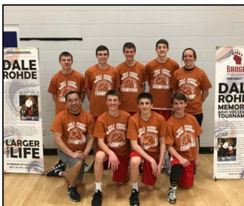
WVA Nightmares 16-Black (B15/16 Champs)