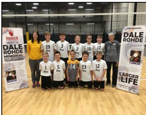
Milwaukee Sting 12-Gold (B12/13 Champs)