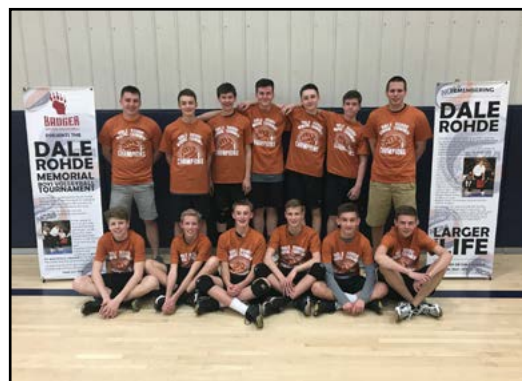
Milwaukee Sting 14-Gold (B13/14 Champs)