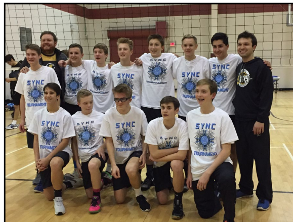
The Milwaukee Sting Boys 15-Gold team won the Dec. 18 boys tournament at the Schaumburg (Ill.) Sports Complex. Send your photos for publication to brian@badgervolleyball.org .

July 18-23: USA Volleyball High Performance Championships in Fort Lauderdale, Fla.