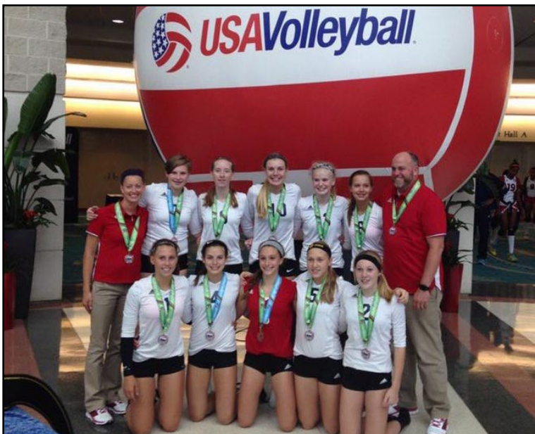
The Girls National Select Team, above, and the Girls International Youth teams both only finished with two losses each at the 2016 High Performance Championships in Florida.