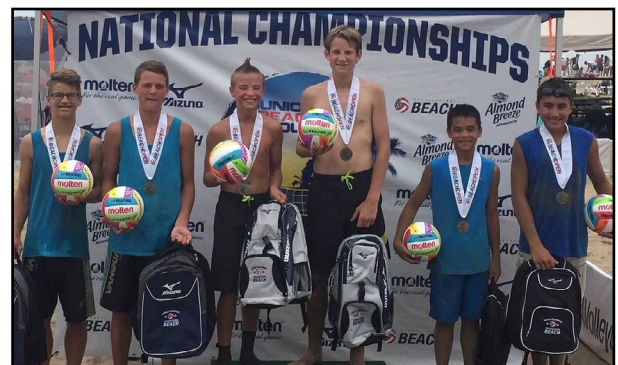
The Boys 14-and-under Open Division Champions from the Junior Beach Tour are shown.

Nov. 19: First day clubs can hold tryouts for Boys 15-and-over in the Badger Region.